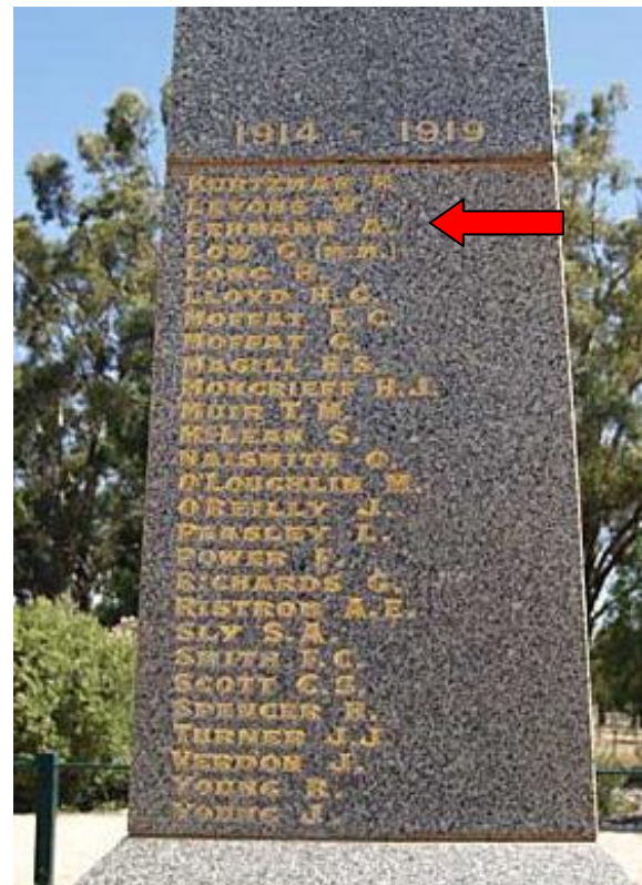
Lockhart & District War Memorial